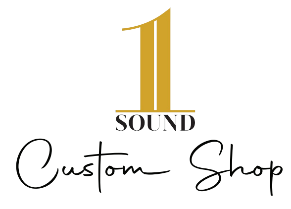
DRIVEN BY OUR PASSION FOR THE CRAFT

At 1 SOUND, we offer all of our products in custom color variations and natural wood finishes. We are happy to work with clients to ensure that their design goals are satisfied. Our local sourcing of building materials allows us to manufacture custom orders with a quicker turnaround. With 1 SOUND Custom Shop, you can have an aesthetically individualized audio system, hand built with 1 SOUND's signature sound.